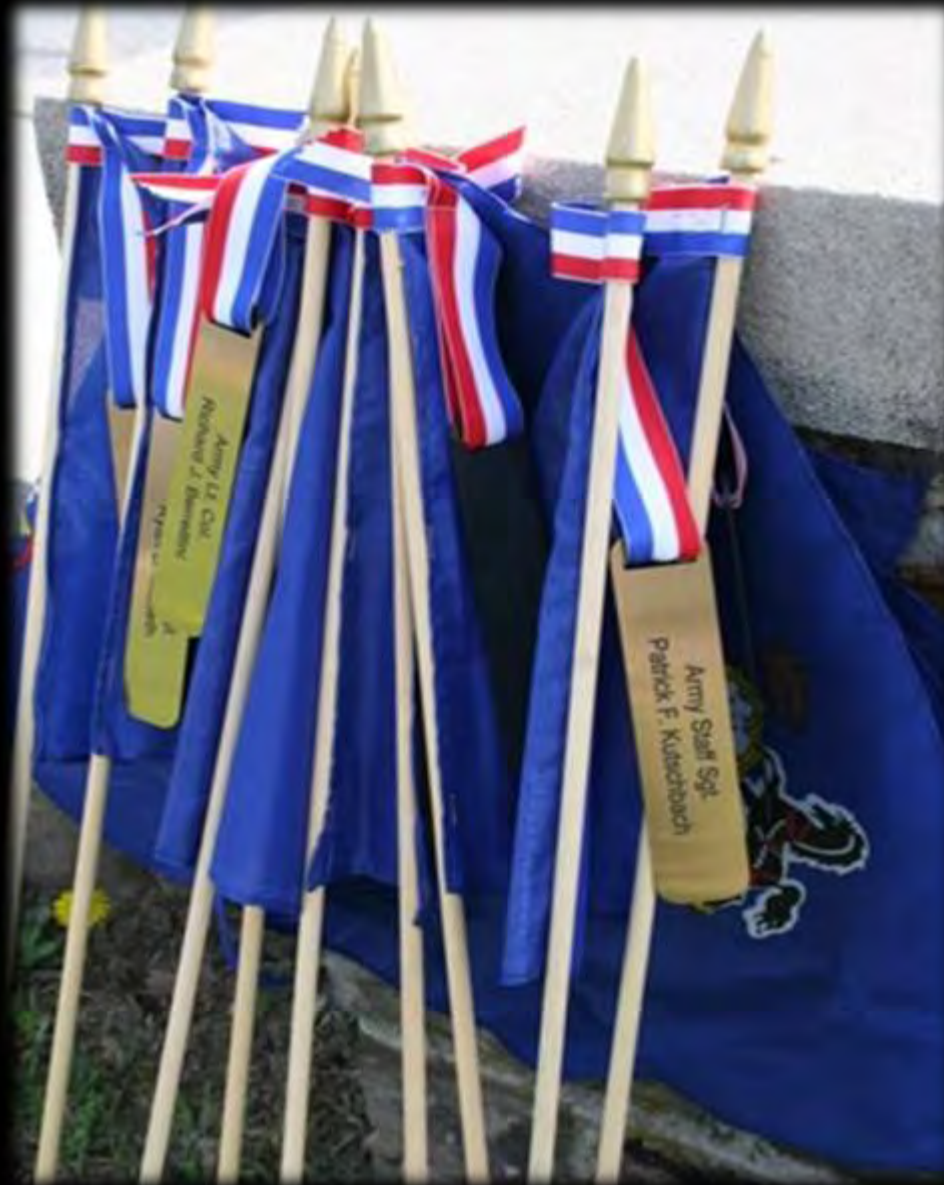
NAME TAGS ARE INCLUDED IN THE PENNSYLVANIA DISPLAY.