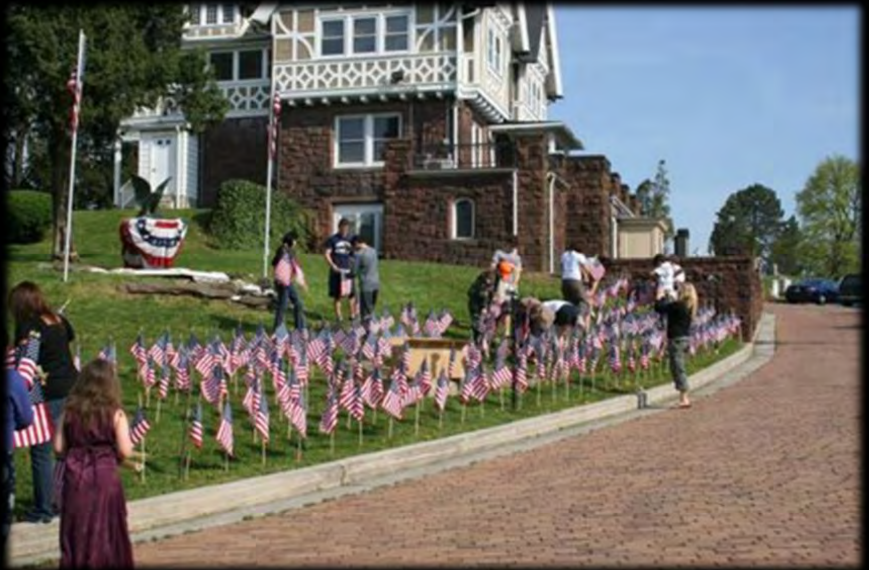
GOLD STAR FAMILY MEMBERS HAVE BEEN A BIG PART OF THE CEREMONY. THEY ARE RELATIVES OF SOLDIERS WHO HAVE BEEN KILLED IN ACTION.