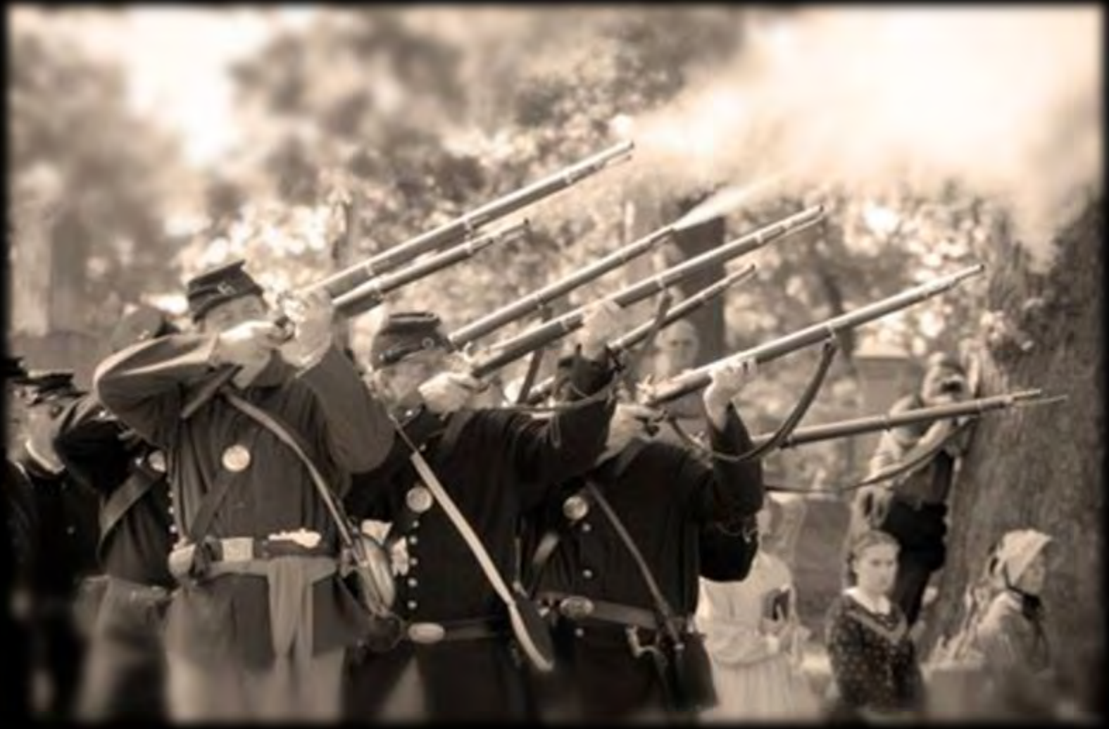
A RICH CIVIL WAR HISTORY HAS MADE PROSPECT HILL CEMETERY HOME TO MANY CIVIL WAR RE-ENACTORS.