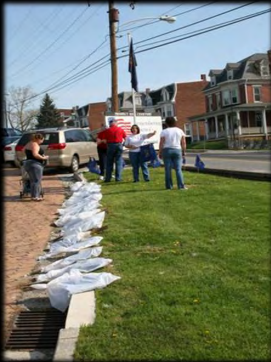
GOLD STAR FAMILY MEMBERS READ THE NAMES OF PENNSYLVANIA'S FALLEN SOLDIERS BEFORE PLACING THEIR FLAGS INTO THE GROUND.