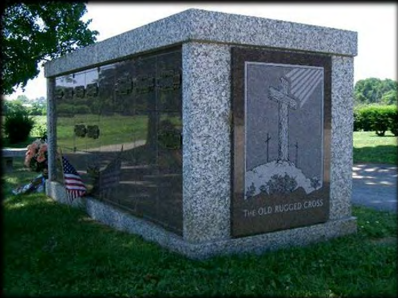
— THE OLD RUGGED CROSS COLUMBARIUM —

THE COLUMBARIUM CONTAINS BOTH SINGLE AND COMPANION NICHES WHERE URNS CAN BE PLACED. THE STAFF AT PROSPECT HILL HAS DEVELOPED A WIDE RANGE OF OPTIONS FOR CREMATION DISPOSITION, WITH THE GOAL OF MEETING ANY FAMILY'S NEEDS.