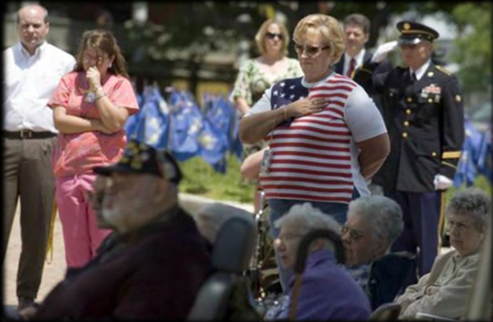
THE FLAG UPDATING CEREMONY HAS BECOME A COMMUNITY EVENT, WHERE MANY PEOPLE COME TO PAY THEIR RESPECTS.