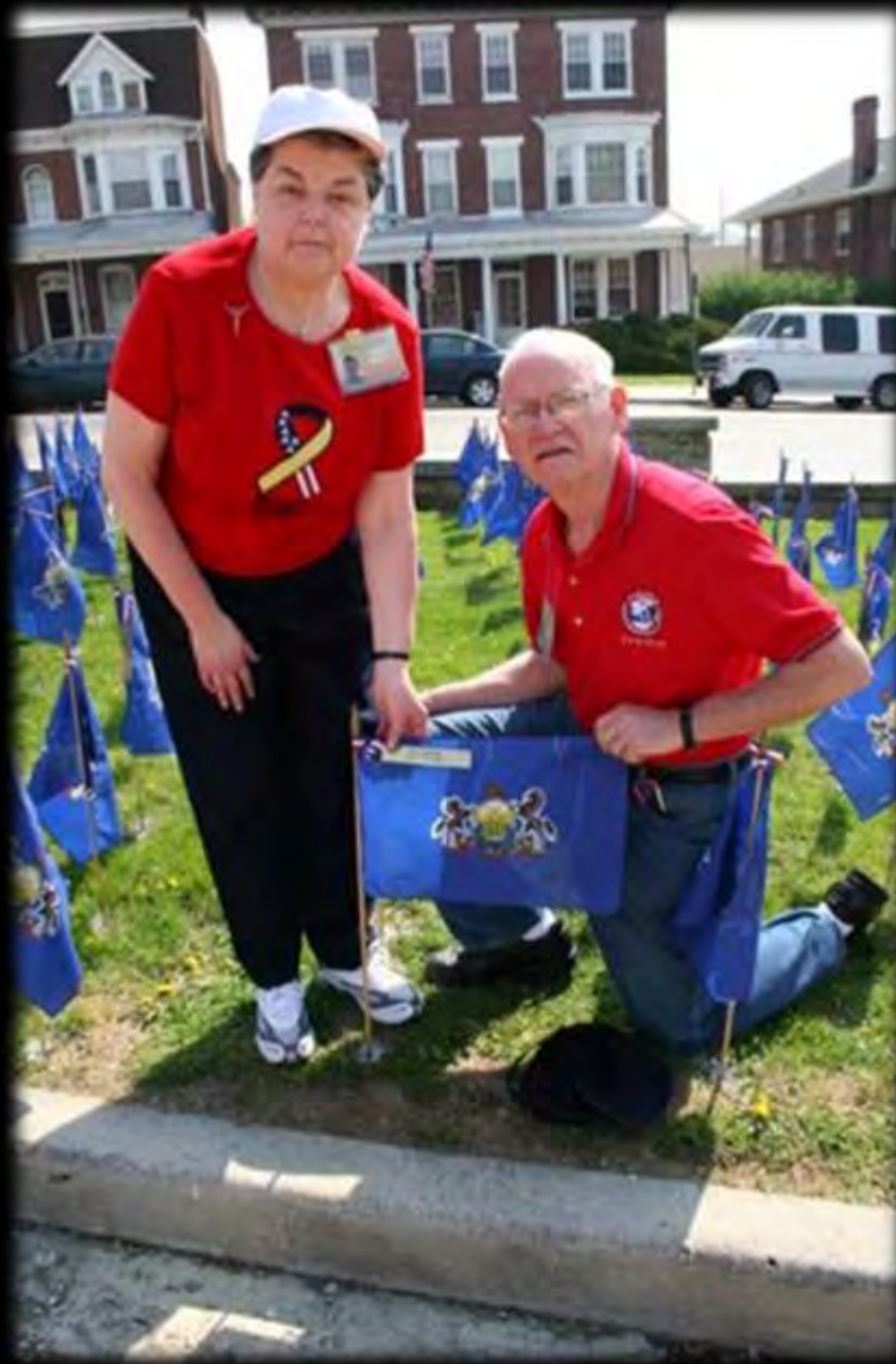
THESE PARENTS CAME FROM WEST CHESTER IN ORDER TO HONOR THEIR SON'S MEMORY.