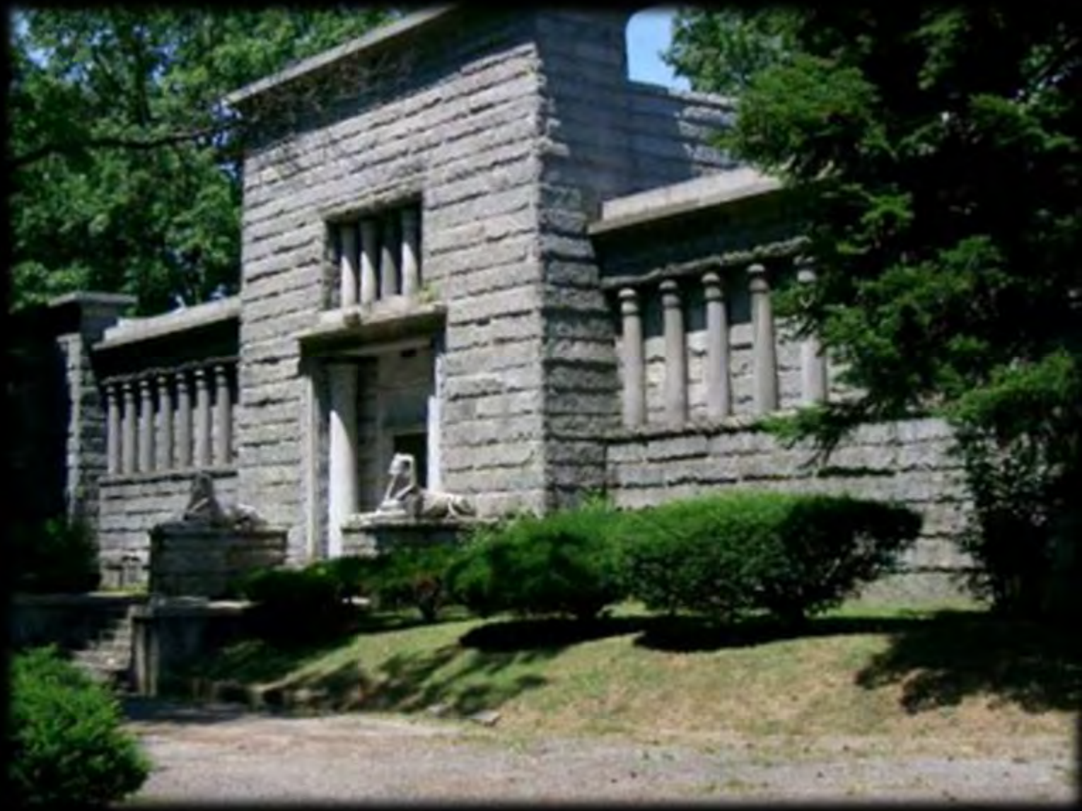
THIS IS THE REGION'S FIRST COMMUNITY MAUSOLEUM. THE FIRST ENTOMBMENT HERE OCCURRED IN 1915.