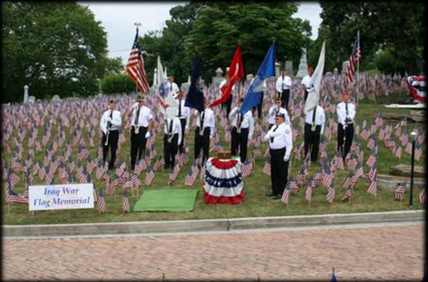
THE YORK COUNTY HONOR GUARD USES THE FLAG DISPLAY DURING A FLAG RETIREMENT CEREMONY. THIS EVENT WAS MADE POSSIBLE WITH THE HELP OF HEFFNER FUNERAL CHAPELS & CREMATORY AND THE WEST YORK VFW.